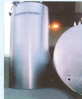
U.S. Concrete RW-15 Washington, DC