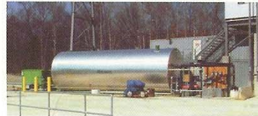
P-20-20W & PH-1520 New Rock Concrete