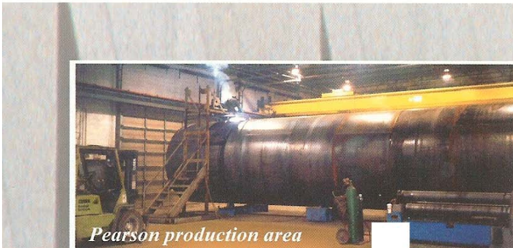
Pearson production area

OPERATES ON #2 OIL, NATURAL GAS, PROPANE • ECONOMICALLY PRICED