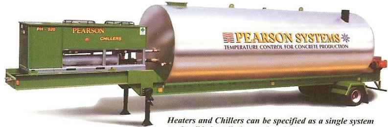
Heaters and Chillers can be specified as a single system to simplify installation and mobility. Ideal for portable plants.

As compared to the traditional method of using ice to cool concrete, these chillers are able to save as much as 95% per yard of concrete—to dramatically reduce production costs! In addition, all of the problems associated with manual handling, storage and supplying ice are eliminated to cut labor needs. Another plus is that these chillers allow for the precise control of both water temperature and the volume of water going into the mix, to ensure consistency. Customers realize all the advantages that a superior piece of equipment can offer with pay-back in a very short period of time.