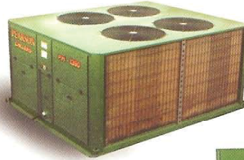
PH-1390 C.T.L., on site Federal Dept. of Transportation, Washington, DC